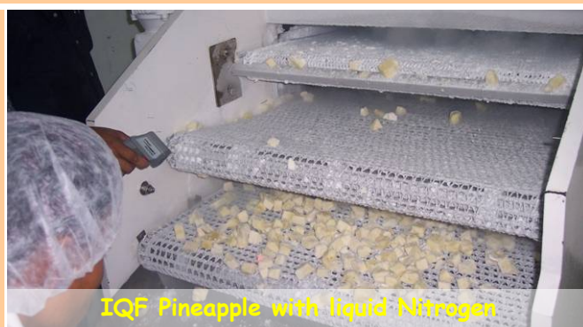
IQF Pineapple with liquid Nitrogen

Processing – Trials with litchi packed in syrup; development of yellow chilli pastes; processing of Jalapeño nachos; delivery of final HACCP assessments for several processing plants; quotes for fruit peeling equipment, chlorine meters, sanitation equipment and temperature sensors for shipments; recommendations on cleaning and cross-contamination; development of a HACCP plan and frozen product specifications; support in dehydrated mango processing; IQF butternut squash trials; support of sanitary plant design; advice regarding chlorine use and allergen control; legal requirements for exports; pH meter calibration; legal requirements for exports; evaluation and improvement suggestions for frozen mango processing line; plant remodeling recommendations; company registration – Bioterrorism law