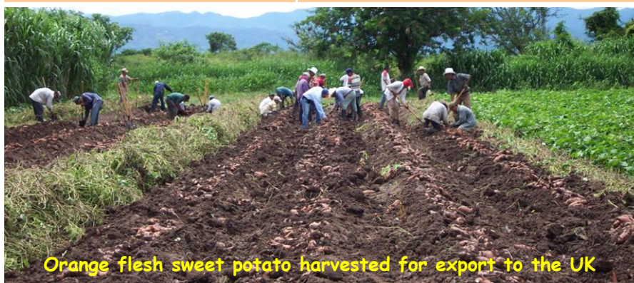
Orange flesh sweet potato harvested for export to the UK