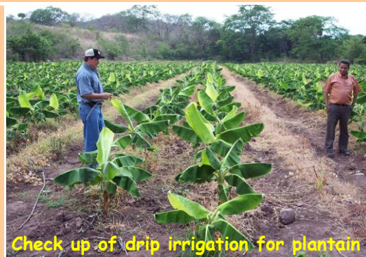
Check up of drip irrigation for plantain

Marketing and Market Information – Scheduling of planting and marketing of chayote; support with a shipment of dehydrated fruit to buyers in the US; yuca production program for interested buyer; contacts between producers and processors of frozen squash and quotes for raw materials; coordination of placement and delivery of orders of Jalapeño peppers to Guatemala; contact between a buyer of cut Jalapeño and a Honduran processor; linkage between a Salvadoran Jalapeño buyer and producers in the Western part of Honduras; support chayote marketing in Honduran supermarkets; participation in electronic special coffee auction; contact with processed butternut squash buyer; brochure layout for a microprocessor of canned products; support with label design for microprocessors; linkage between distributors and microprocessors.