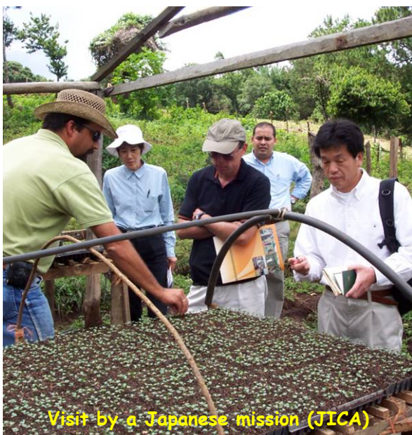
Visit by a Japanese mission (JICA)