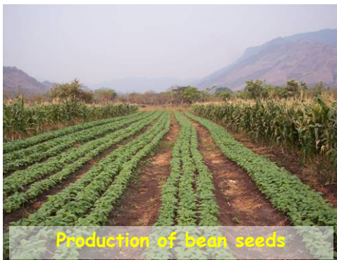
Production of bean seeds