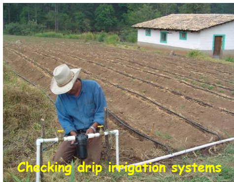
Checking drip irrigation systems

Onion- Sales for June 2005 totaled 95 bags (4,750 lbs) worth Lps. 11,4000 for the producers. Local production is equivalent to the substitution of 69 imported containers, for a total of 2.88 million lbs in 2004. Yields in June averaged 1,000 bags per hectare.