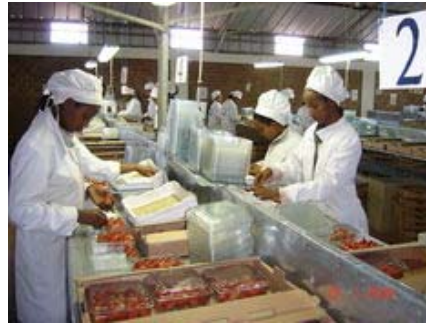
The strawberries have been taken up by Morrisons

Dr Chris Bishop of the Writtle Postharvest Unit said: "The results from the Ethiopian strawberries were very similar or better than those purchased at other supermarkets."