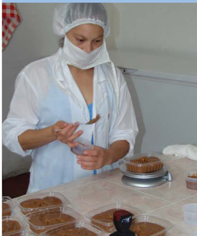
'Dulce de Leche' processor in Francisco Morazán

Examples: Purchase of plantain seeds, equipment for irrigation and its installation, fruit trees, packing infrastructure, vehicles, among others.