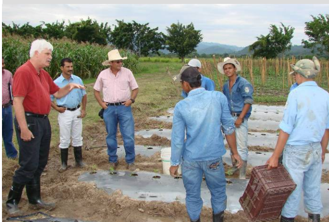
The Director of USAID/Honduras visited Escuela Agrícola Pompilio Ortega in Macuelizo, Sta. Bárbara