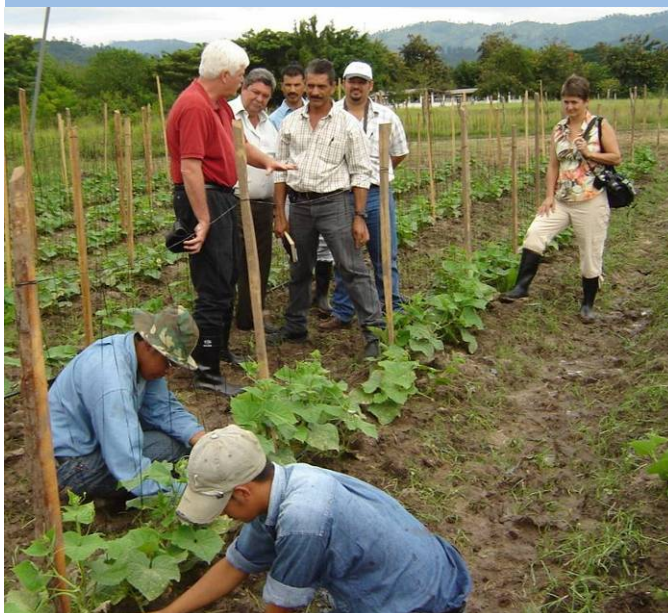
The Director of USAID/Honduras visited Escuela Agrícola Pompilio Ortega in Macuelizo, Santa Bárbara

Examples: Soil preparation, installation of irrigation systems, fertilization using irrigation systems, greenhouse management, equipment calibration, GAPs, basic practices, among others.