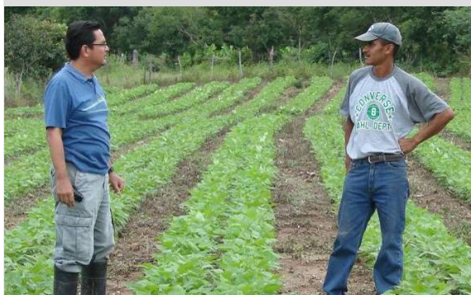
Bean crop in Cantarranas