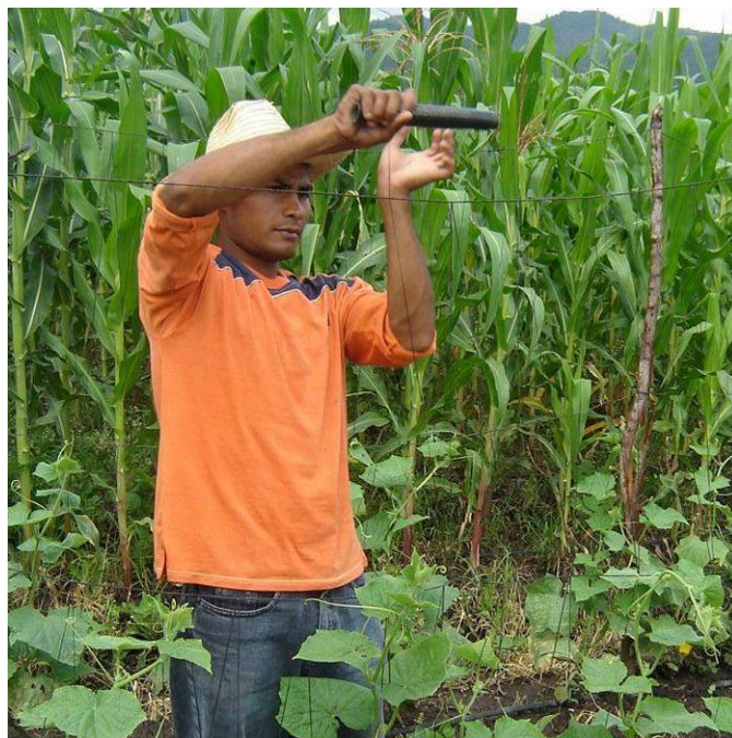
Nathaly pepper harvest, Francisco Morazán