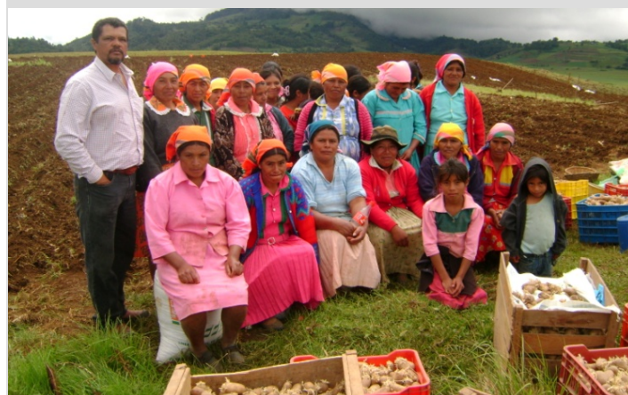
A COAAL women's group poses in La Esperanza, Intibucá.